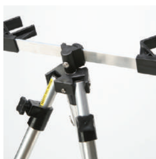
Tripod in low positions