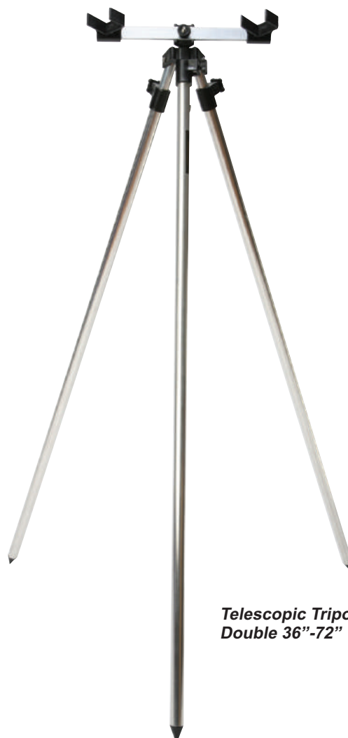
Telescopic Tripod Double 36"-72"