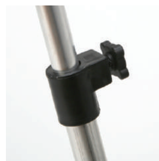
Adjustable telescopic legs