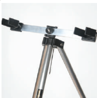
Adjustable & reversible rod rest head