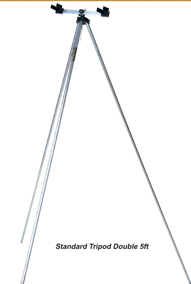
Standard Tripod Double 5ft