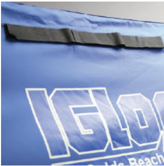
Velcro rod straps