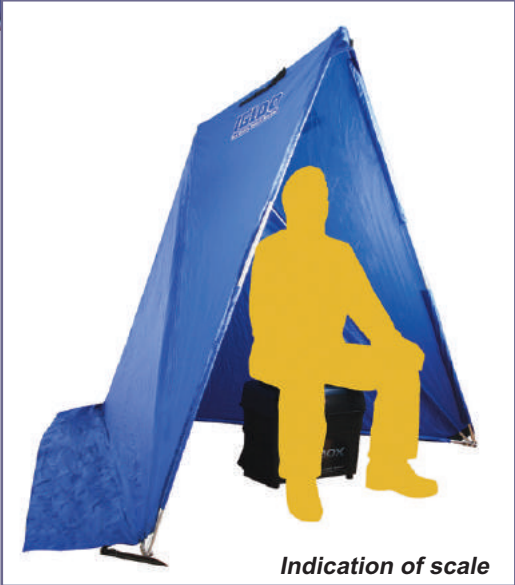
Indication of scale

Unique beach shelter with improved adjustable extender bars that can be erected in seconds on most surfaces. Adjustable height depending on how far apart legs are spread. Rolls up straight, big enough for two anglers and all their tackle. Lays flat on the ground before erecting, making it exceptionally easy to put up, even in high winds! Angler can sit on their tacklebox and still have plenty of headroom ... even when wearing a head lamp! Velcro straps to hold spare rods when fishing. You can even stand up in it.